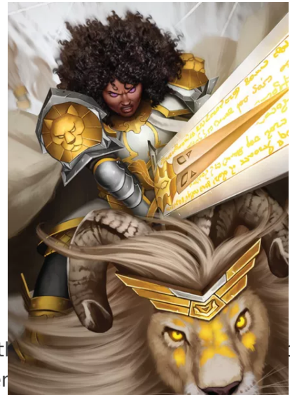
Alternate art full bleed

Odette forged the Sword of Virtue herself, as well as penned all the laws. She has enforced the law of Lordswall for generations, and can dispense justice as equally.