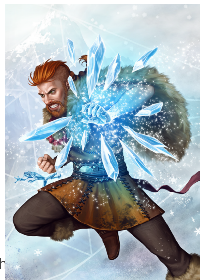
Alternate art full bleed